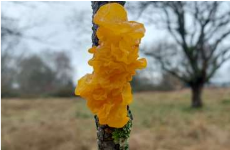
The fungus Tremella mesenterica (witch's butter) on a dead oak branch on the Green near the bus stop.