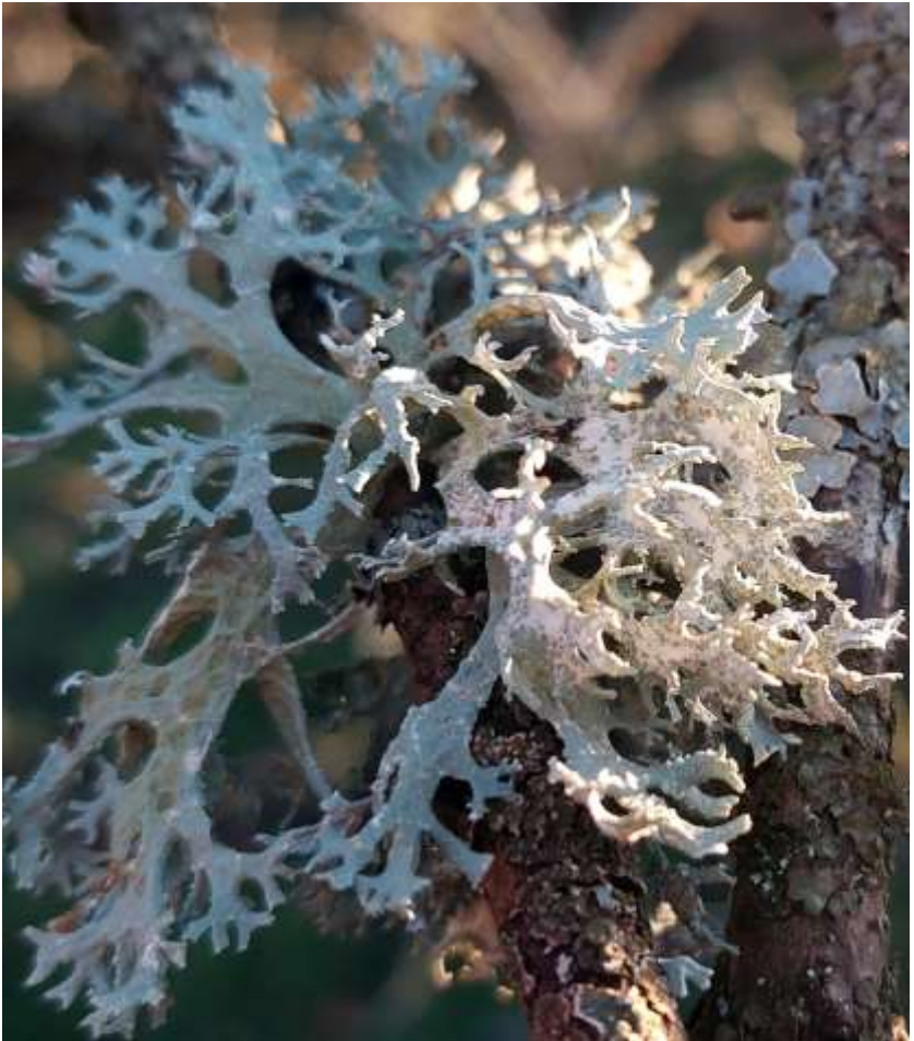
Evernia prunastri (oakmoss). Note darker upper surface of thallus fronds to left and the white underside of the fronds (right), and granular soredia.